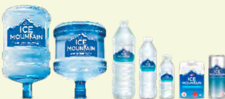
F&N ICE MOUNTAIN Drinking Water