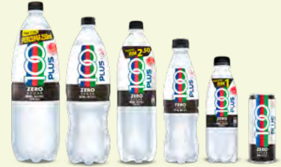
100PLUS Zero Sugar