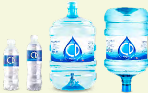
Bottled Drinking Water CD