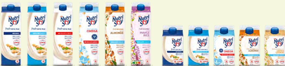
F&N NUTRISOY Vegan-Friendly (Pasteurized)