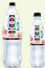
100PLUS Peach with Zero Sugar