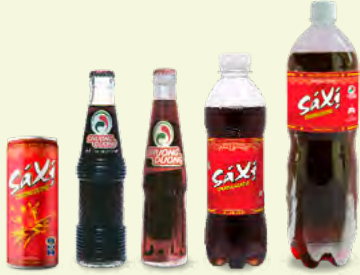
Sa Xi Chuong Duong