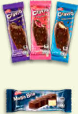
F&N MAGNOLIA CRAVIO