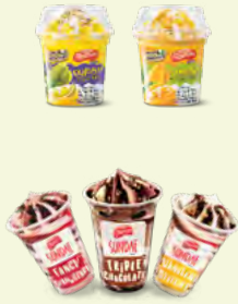
F&N MAGNOLIA CUP