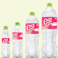
est Salty Lychee Plus B