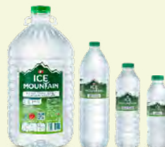
F&N ICE MOUNTAIN Mineral Water