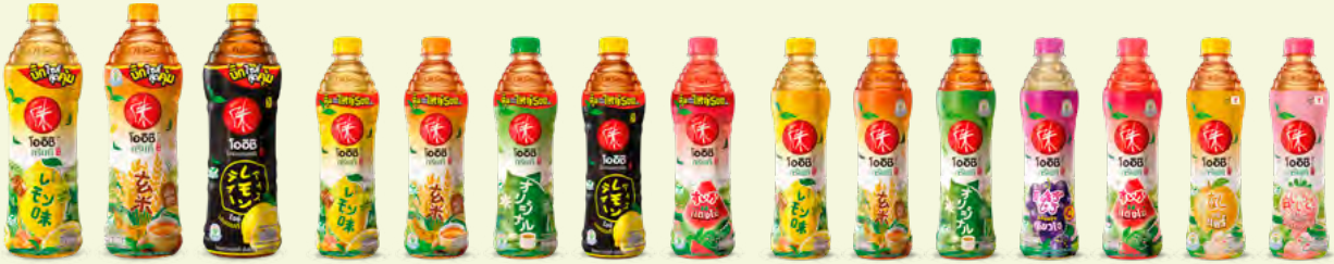
Oishi Green Tea