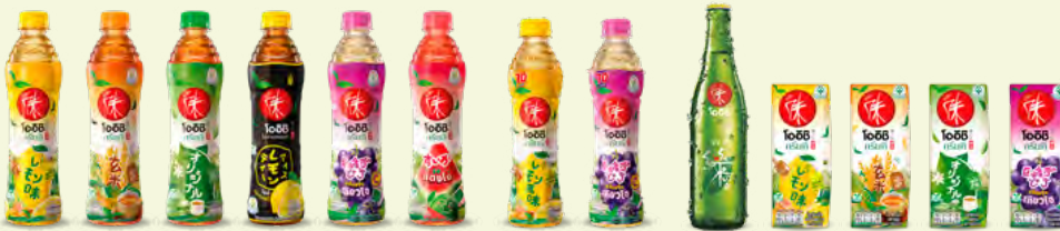
Oishi 0% Sugar