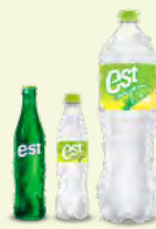
est Lemon Lime