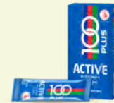
100PLUS ACTIVE Powder